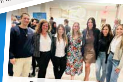
The BLF Team attending the Texas Trial Lawyers Association's 2024 Annual Meeting & CLE Seminar